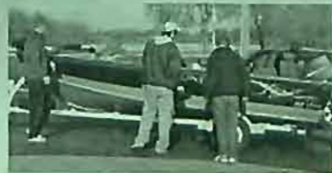
DNR Inspector at Boat Launch

Reflecting on the season to come, I can envision the anglers on the ice quite soon. The activity is not only fun to watch, but, also, fun to be out on the lake immersed in the elements. We are at nature's mercy staving off the cold just to be lucky enough to pull in a fish. It is fun to visit with the others on the lake who are trying to enjoy this wonderful time of the year. If you have the great opportunity to walk, snow-shoe, ski, or snow mobile the lake, I encourage you to visit with the fellow lake lovers who are in pursuit of the fish. It is great fun. Perhaps, in your conversation with them you could encourage them to keep the lake clean in every way..... We need this to preserve our lake. Last year, I observed tremendous waste including human waste on the lake. I was appalled that anyone would treat such a treasure so poorly. Any way, keep warm and have fun. Life is short .... Treasure everyday and the wonderful environment with which we have been gifted. Jerry Piche, boat launch coordinator.